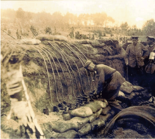
German battery of chlorine gas cylinders being prepared for an attack, awaiting the right weather conditions to prevent blowback; similar to the arrangement at Hill 60 in May 1915