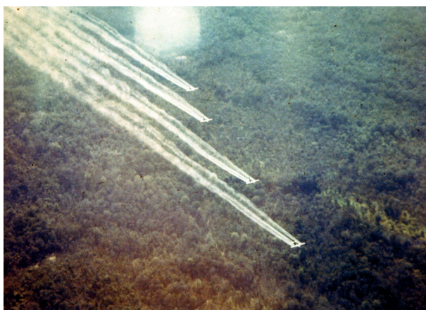
Operation Ranch Hand: Spraying Agent Orange to deny the enemy jungle cover during the Viêt-Nam war in the 1960s.

... the intentional application for hostile purposes of toxic substances against humans and their environment.