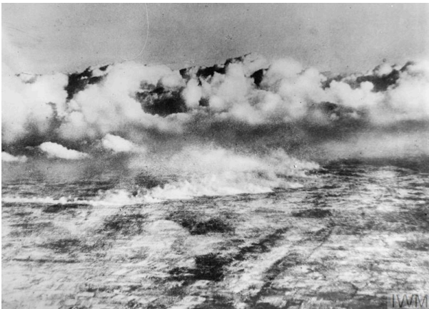
Gas Attack by the German Army on the Osowiec Fortress, Poland, during the 1st World War

Imperial War Museum IWMQ 12286 (Public domain)