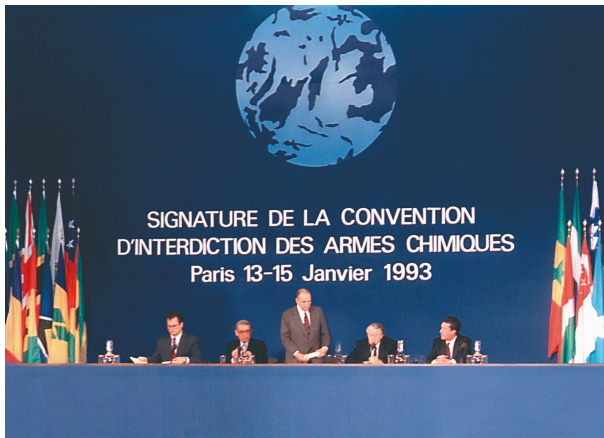
Opening for signature (1993) OPCW

As of July 2021, the CWC comprises 193 states parties. With this it is the world's most successful weapon control treaty. Only four states still need to ratify or accede to it: Egypt, Israel, North Korea and South Sudan.